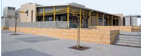
Mazenod College (WA)

Mazenod College (WA) has just opened the new Province Design and Technology Centre and Mazenod College (VIC) is just completing extensions to the chapel and new senior classroom block and library.