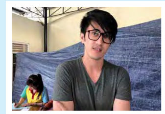
This man is 25 and from Afghanistan. He has spent five years in an Indonesian camp waiting for the UN to find a country willing to accept him.

I visited several clinics founded by the Oblates. One that I share with you is in our parish in Jakarta, run by parishioners, specifically a group of doctors and nurses. It serves the poorest of the poor, among whom are refugees from a local detention centre.