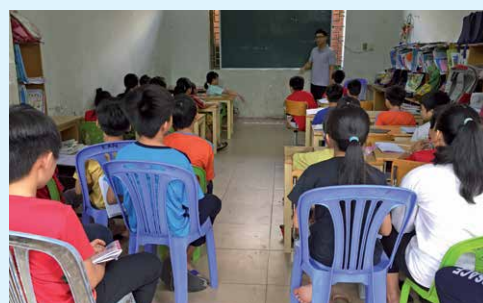
WE CONTINUE TO ASSIST THE WORK OF OUR VIETNAMESE OBLATES WITH THEIR WORK AMONG DISADVANTAGED CHILDREN