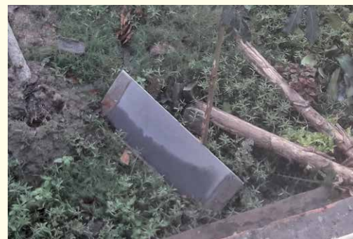
CYCLONE AMBAN RAVAGES AREAS WHERE OBLATES MINISTER IN INDIA