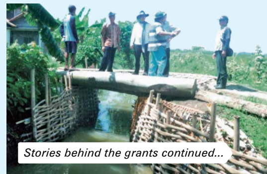
Stories behind the grants continued...

If you wish to make a donation to MAMI apart from the Annual August appeal, your gift is always happily received. To assist our administration and avoid confusion you might like to use this donation slip.