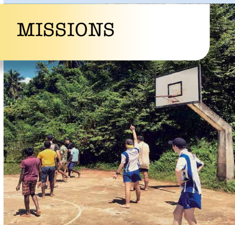
St Vincent's Orphanage