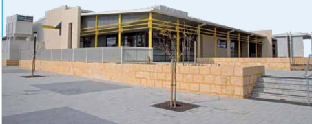
Mazenod College (WA)

Mazenod College (WA) has just opened the new Province Design and Technology Centre and Mazenod College (VIC) is just completing extensions to the chapel and new senior classroom block and library.