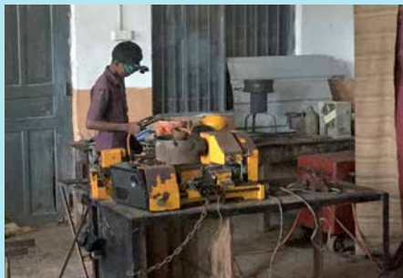
This workshop at St Joseph's orphanage desperately needs refurbishing.