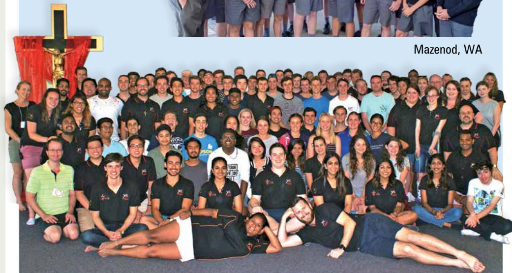
2018 National Oblate Youth Encounter