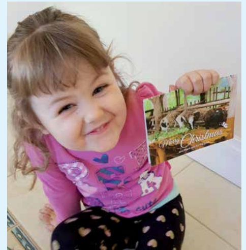
This young lady's photo is used with the permission of her mother.

Your support of the Christmas card projects will share the joy of the birth of Christ to many served by our missions overseas.