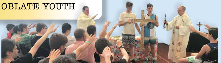
Iona College, Queensland